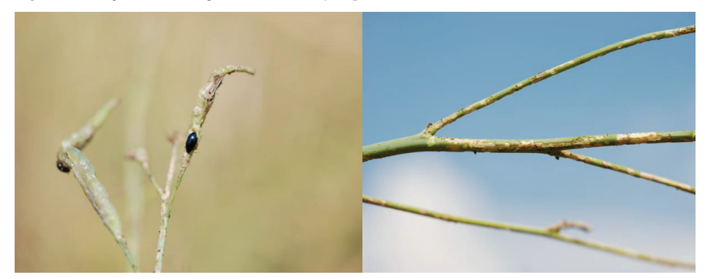
Figure 5. New generation of P. chrysocephala feeding on oilseed rape husks and branches, June 2011