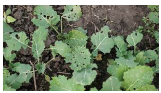
Figure 3. Feeding scars on oilseed rape and turnip rape leaves, October 2010

can be used as a trap crop for management of this pest. In July no emergence or flight of beetles was recorded. Photoeclector cages were left in the field throughout a fallow and further on during the following year, when an emergence of as much as 0.5 beetles/m<sup>2</sup> was recorded in the most infested organic field on 5 March 2012, while 0.81 beetles /m<sup>2</sup> were found in the trap crop.