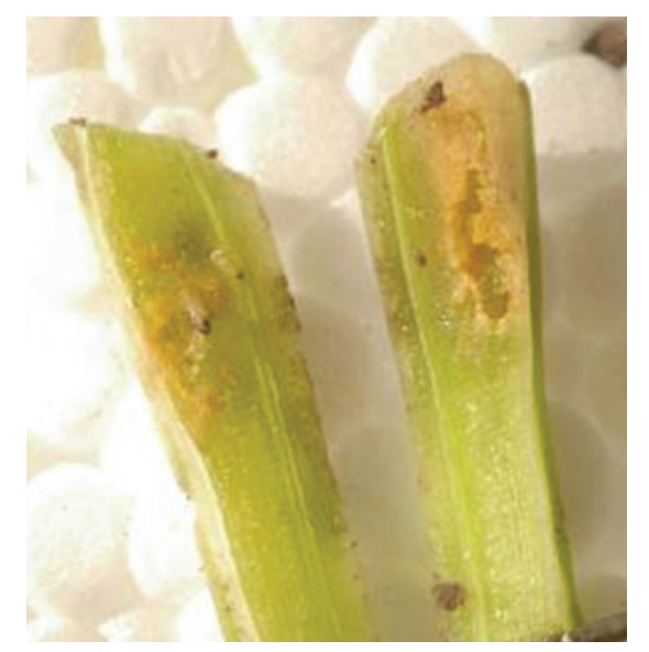
Figure 2. Feeding tunnels of P. chrysocephala larvae in oilseed rape leaf petioles, 30 November 2010

During November, adults were noticed on the ground around oilseed rape plants, which indicated egg laying. The first sampling and dissection of leaf petals were done on 10 November 2010 (BBCH 17-18). Dissection data showed that larvae were at the beginning of development (L1) and that sampling and dissection were performed too early. The second sampling and dissection were conducted on 30 November 2010. The results of dissection revealed that 76% of the plants in the organic field were infested, while 31% of leaf petioles contained P. chrysocephala larvae (Figure 1). In the integrated field, 44% of the plants and 14.5% of all dissected leaf petioles were infested. In the conventional field, no infested plants were recorded. Due to damaged leaves, plants were not able to successfully overwinter. In the organic field, which was most infested, the number of plants in the spring was reduced by 51%, from 43.0/m^2 to 22.0/m^2 , while a reduction did not occur in the conventionally managed and integrated fields, where the numbers varied from 30.3/m^2 to 30.5/m^2 , and 31.2/m^2 to 35.0/m^2 , respectively.