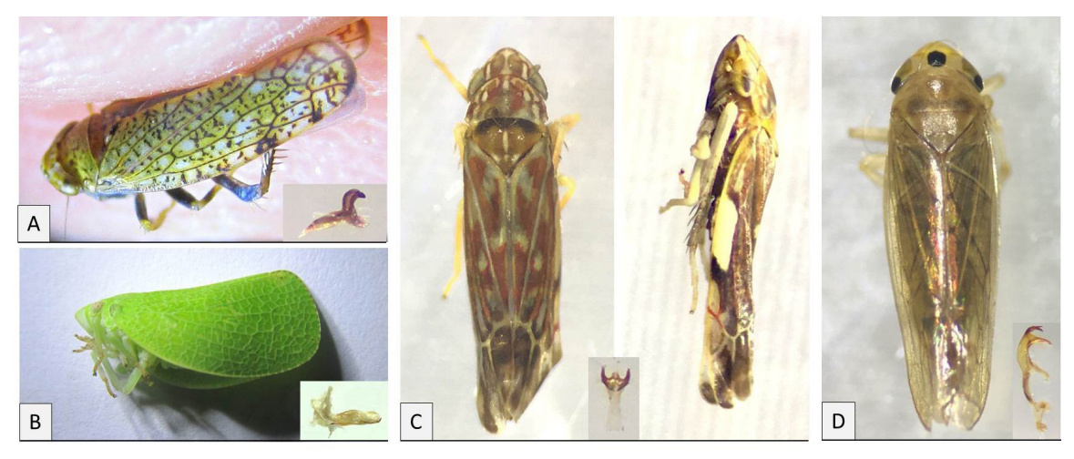
Figure 2. Photographs of alien Auchenorrhyncha species either recorded for the first time in Serbia or confirmed as present: (A) O. ishidae , aedeagus-lateral view; (B) A. conica , aedeagus-lateral view; (C) E. vulnerata , aedeagus-ventral view and (D) Ph. cyclops , aedeagus-lateral view

12.08.2018; (2) Markovac, along A1 motorway (central Serbia), [44°14'10.6"N 21°07'00.3"E] (EP09), 13^{\circ} swept on Ulmus sp. , 27.07.2019; (3) SNR Deliblatska peščara, Kajtasovo, Ludvig polje (Vojvodina, north Serbia) [44°50'27.11"N 21°17'14.33"E] (EQ26), 13^{\circ} attracted by a light trap, 29.08.2019.