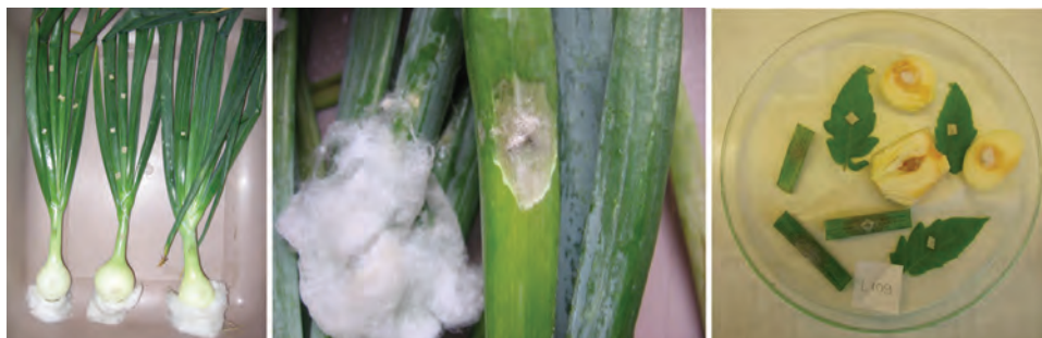
Figure 2. Botrytis squamosa . Pathogenicity test: control plant parts inoculated with sterile PDA plugs (left), artificially inoculated fully developed leaves (central), and artificially inoculated onion bulbs and detached leaves of tomato (right)