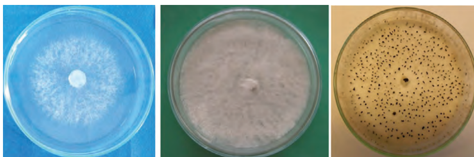
Figure 3. Botrytis squamosa . White uniform aerial mycelium with entire margin after incubation at 20°C for 3 days (left); Mycelial type of isolate after 10 days of incubation (central); Sclerotial type of isolate after 10 days of incubation (right)