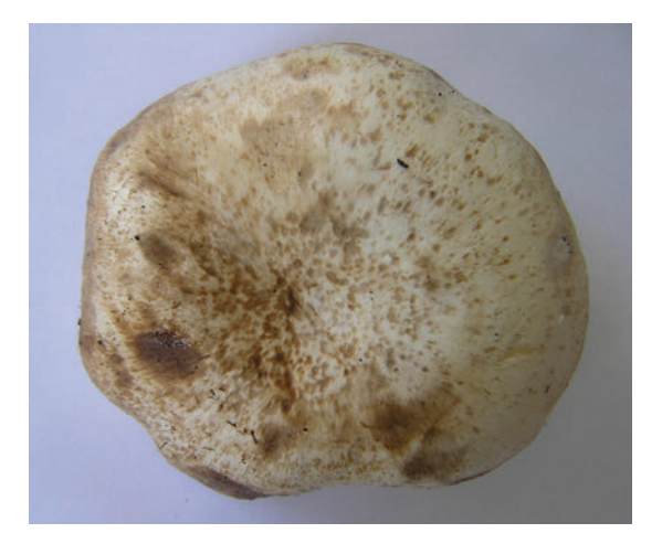
Figure 1. Sunken brown lesions on A. bisporus caps induced by P. tolaasii

Our monitoring of bacterial diseases in mushroom farms and fresh markets in Serbia revealed the presence of symptoms of brown blotch or different degrees of brown discoloration on fruiting bodies of A. bisporus (Figures 1 and 2). Over a hundred bacterial isolates were obtained after isolation from symptomatic samples. Forty-five green fluorescent, Gram negative isolates from different sources and locations were selected for pathogenicity tests. The bacterial isolates showed different degrees of discoloration and tissue degradation on the mushroom cubes, varying from light to dark brown (Figure 3). Thirty-six bacterial isolates caused sunken brown lesions on A. bisporus cap tissue blocks after 72 h, consistent with those caused by the reference strain of P. tolaasii. The remaining isolates showed light brown superficial discoloration both on tissue blocks and sporophores similar to the P. agarici reference strain.