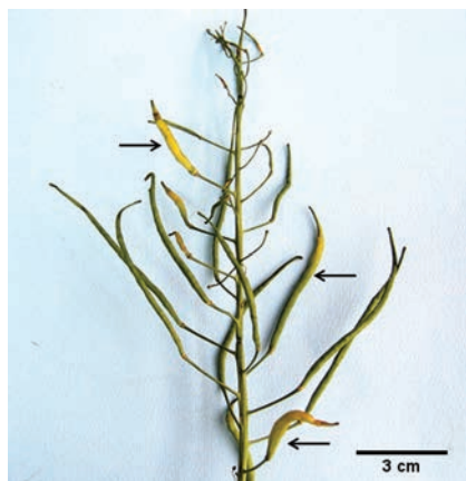
Figure 4. Damaged pods of oilseed rape change their colour, often deforming, drying and cracking

During our examination of infested pods, special attention was paid to detecting damage caused by the cabbage pod weevil Ceutorhynchus assimilis , (syn. C. obstrictus ), which is important for infestation intensity of D. brassicae . In this study, damage caused by that weevil species was not observed. A single larva of C. assimilis was found in the total of 773 examined pods, so the correlation between these two species was not determined. Similar observations had been reported in the Czech Republic (Kazda et al., 2005), while other literature data show that the midge uses openings made by C. assimilis for oviposition (Åhman, 1987; Pavela et al., 2007; Aljmlj, 2007; Williams, 2010).