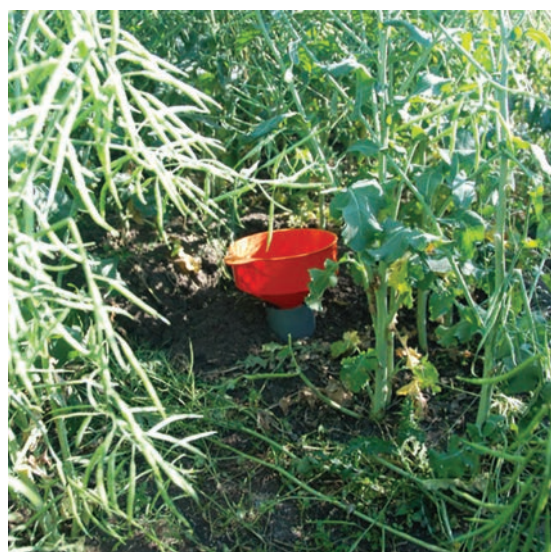
Figure 1. A funnel trap used to monitor the time when larvae leave pods and go into soil

Yellow Water Traps (YWT), Syngenta type, were used to detect the emergence of first generation adults of D. brassicae . They were set up in four places in the middle of the field at 50 m distance.