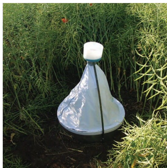
Figure 2. An emergence trap used to monitor the emergence of D. brassicae from the ground

D. brassicae midges developed two generations per year on the trial site and overwintered in the larval stage in cocoons in soil, as they do in most other European countries (Williams et al., 1987; Ferguson et al., 2004;